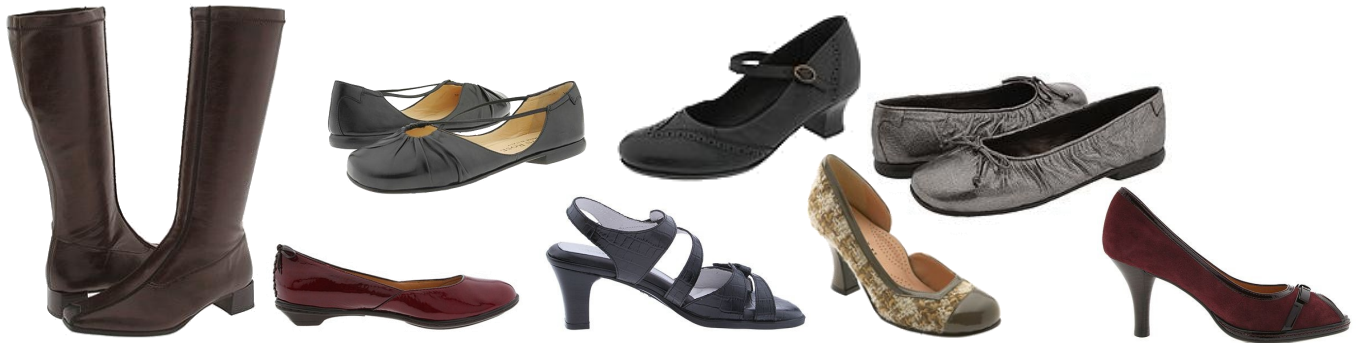
Clockwise, beginning at left is Rieker's Style #98452; Taryn Rose's Bijou; Rieker's Sarah; Taryn Rose's Ballerina, Sofft's Gayle; Anyi Lu's Elle; BeautiFeel's Fuchsia; and Sofft's Pilar.