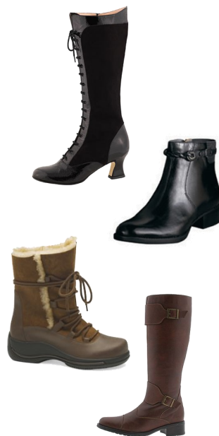
Top to Bottom: Anyi Lu's Stella; Ariat's Yarmouth; Dansko's Chris and Rieker's styles #R0371.

styles, featuring this seasons trend towards a slim toe box and attention to details like adjustable buckles and soft suede and laces for a custom fit. Comfort Couture designer Anyi Lu's collection was inspired by classic Hollywood film heroines and her boots capture the romanticism and luxurious lady-like style of an elegant era gone by. "Women appreciate the intricate details and level of craftsmanship that defines a luxury shoe — they can truly feel the difference," said Anyi Lu. "And they're even more thrilled when the design is so on-point with the trends, allowing them to readily pair my shoes with seasonal styles on a daily basis, whether for day or night."