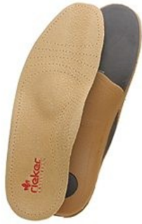
Rieker's Sole Buddies are a high quality nonprescription orthotics.

Orthotics are shoe inserts that are intended to correct an abnormal, or irregular, walking pattern. Orthotics are not truly or solely "arch supports," although some people use those words to describe them, and they perhaps can best be understood with those words in mind. They perform functions that make standing, walking, and running more comfortable and efficient by altering slightly the angles at which the foot