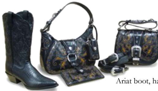
Ariat boot, handbags, belts and wallet.