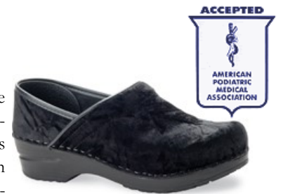
Dansko's Professional clogs are all APMA Accepted. Shown is the Professional in crushed velvet.

Other Strada brands that carry the APMA Seal include Wolky, Pedag, Finn Comfort and Sanita.