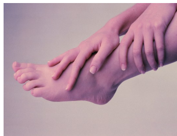
Massage your feet to avoid foot pain this holiday season

Are you on the hunt for the perfect gift? Chances are you’ll spend more time on your feet during this busy shopping season than any other time of the year. All of those extra steps spent decorating, visiting family or trips to the store can add up to some nasty foot pain. Before you head out to pound the pavement, use these easy fixes so you won’t lose a step to foot pain this holiday season.